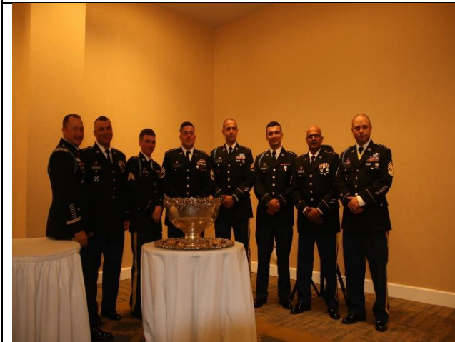
69 th Infantry