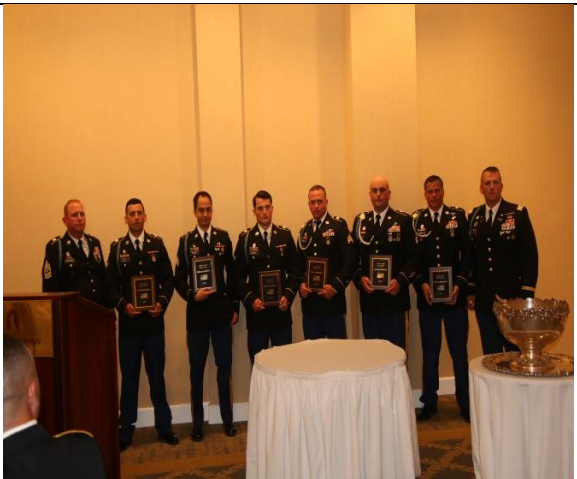
182 nd infantry, MAARNG