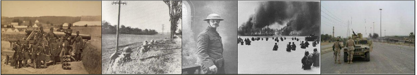
THE 69 TH INFANTRY - A RICH HERITAGE: PROUD TO SERVE - FROM CIVIL WAR, WWI, WWII TO IRAQ AND CURRENT DAY READINESS