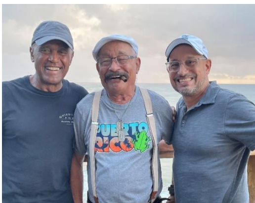
Combat Support Company