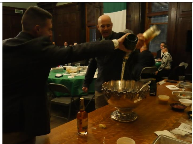
Mixing the Regimental Grog