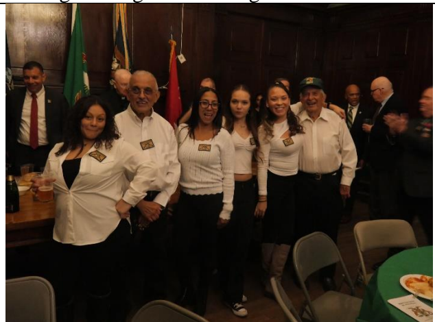
The Gas Range Ladies and their "staff"